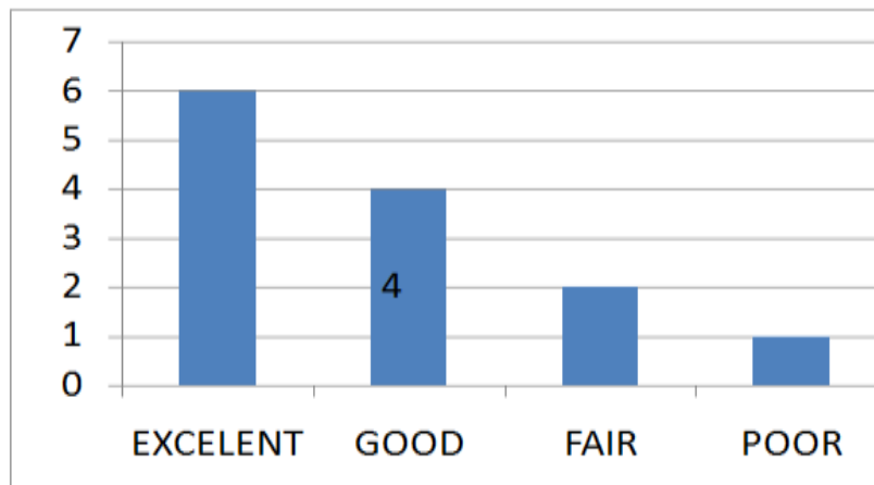
Results of conventional cross k wire technique.

For comparison of the result of both these procedures (conventional and DORGAN tech) we had to use universally accepted FLYNN'S CRITERIA, as well as with other published works..